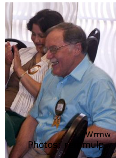
Wrmw Photos: mulp

Or perhaps he is still in shock after ending his presidency in the "black"!